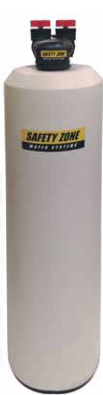
Single Tank Non-Electric Model

Looking for an alternative to a conventional water softener? If so, check out our combination scale inhibitor and whole house filters. Enjoy low maintenance with whole water treatment!