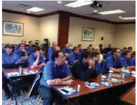
Our training sets us apart!