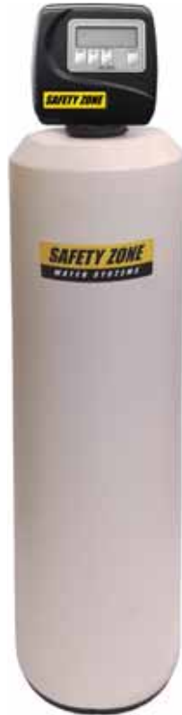
Single Tank Backwashing Model